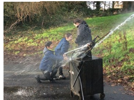
Time for launch!