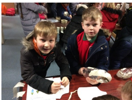
Our engineers at work building rockets.