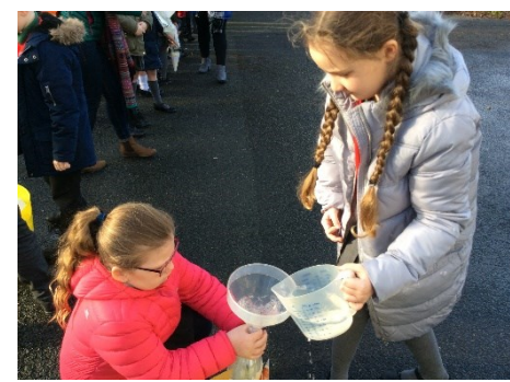
Time to add fuel.